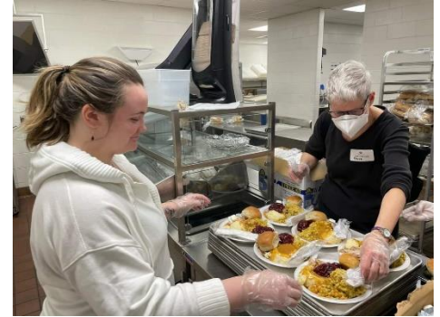
2022 Thanksgiving Dinner at Malden HS