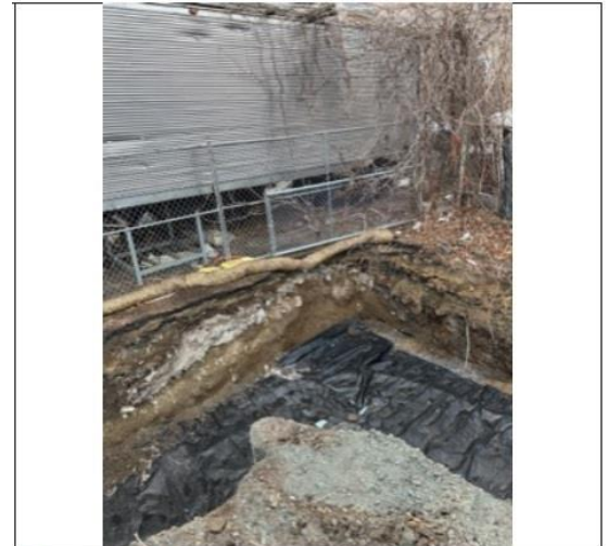
Photo FR10.2 View of the trench along the southeastern corner.