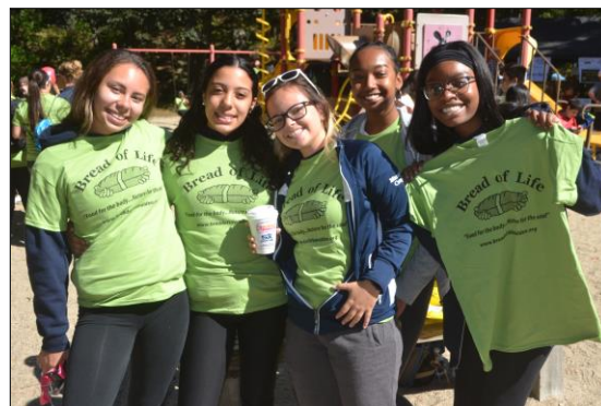
High School athletes participating in the 2017 Walk for Bread & 5K Run.