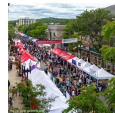
Main Street Melrose, MA 02176 United States

We're excited to be hosting a Bread of Life booth at the Melrose Chamber of Commerce Victorian Fair! Be sure to stop by and say hello! Sunday, September 11th